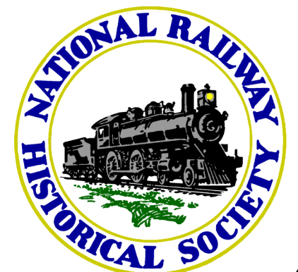
Central New York Chapter, National Railway Historical Society 2017